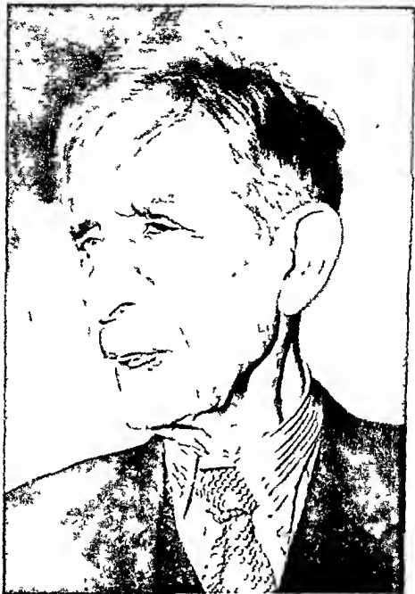
Leonard Woolf From a recent photograph